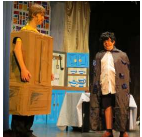
In the panto I was the Clock, I just marked the passing of time for example it may seem like a couple of days since the panto but it's actually been two whole weeks!