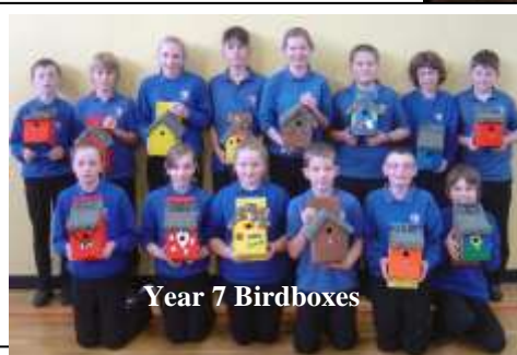
Year 7 Birdboxes

If we have forgotten anyone, we apologise and you will get a mention next time