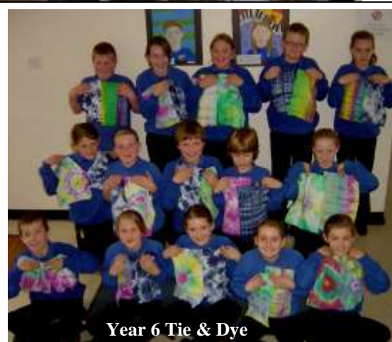
Year 6 Tie & Dye