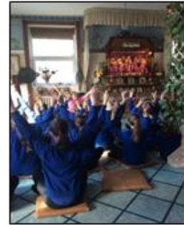
Our Hindu Temple visit

On Wednesday 7 th March, year 6 visited the ISKON temple in Newcastle. We left at 9, arriving at half past 10.