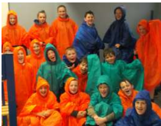
The ponchos came in handy for Tag Rugby in Activity Week when the weather was unkind!!

If your child has grown out of their uniform, please donate it to our recycled uniform scheme. Hand in to the school office.