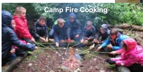
Camp Fire Cooking