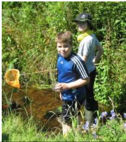
We went to Wooler Common. We learnt new facts about nature. We also got to go in the river! We found some insects in the river. We learnt about them and we kept the insects in a cup. But we had to let them go. We also did a quiz. We had fun!