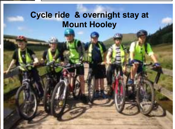
Cycle ride & overnight stay at Mount Hooley