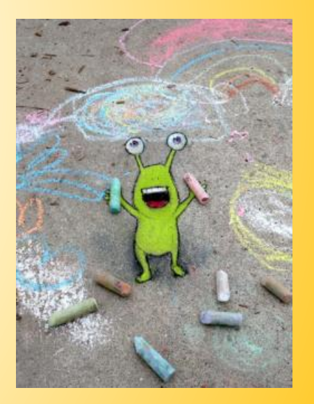
Sluggo's Chalk Frenzy

Most of his creatures appear on sidewalks in Michigan, but many have surfaced as far away as subway platforms in Manhattan, village squares in Sweden and street corners in Taiwan.