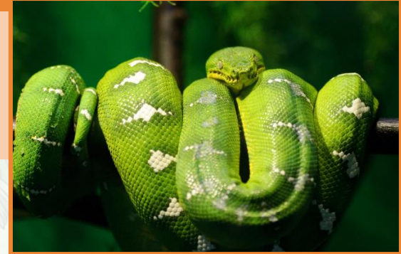
"Emerald Tree Boa" by Eric Kilby is licensed under CC BY 2.0