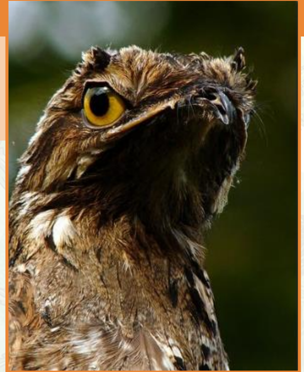
"Mrs. Moon"