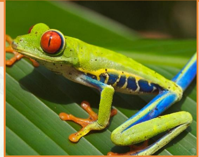
"Red Eyed Tree Frog" by Douglas Tofoli is licensed under CC BY 2.0